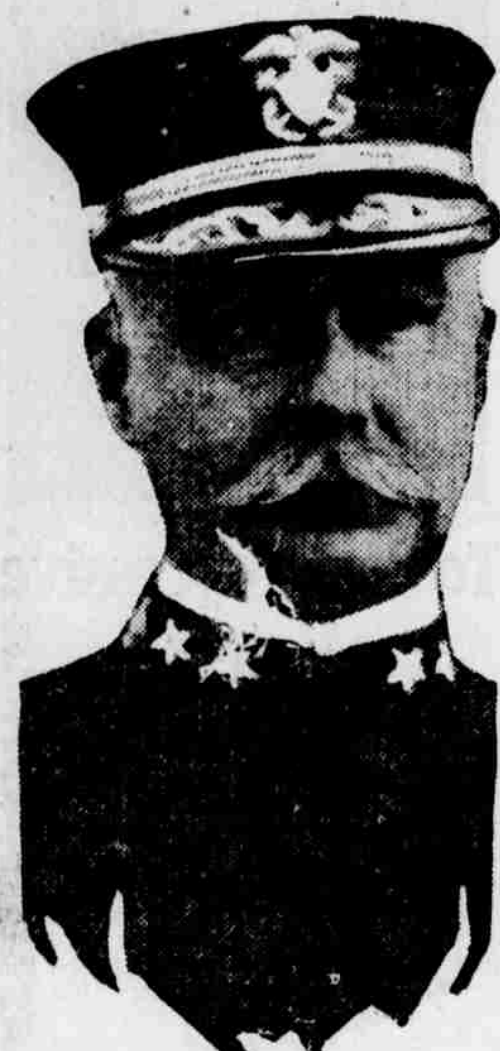
REAR ADMIRAL AUSTIN M. KNIGHT.

Note the position of the cross in the above sample and if you follow this form no mistakes will be made.