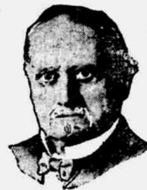
MARCUS J. WRIGHT Famous Ex-Confederate General

"Tux" is the happy smoke. It just packs the smoker's calendar so plumb full of fragrant delight that a gloomy day can't crowd itself in edgewise. That mild, soothing taste of "Tux" has introduced many a man to the joy of pipe-smoking and a regular unending procession of happy days.