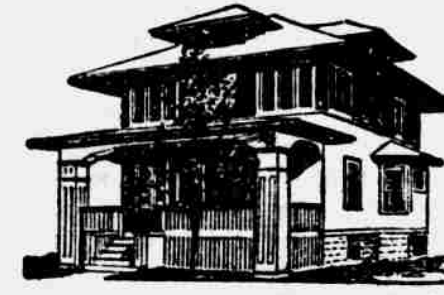
A No. 6-22-W IDEAL Boiler and 600 ft. of 38-in. AMERICAN Radiators costing but $245, were used to heat this cottage. At this price the goods can be bought of any reputable, competent fitter. This did not include costs of labor, pipe, valves, freight, etc., which vary according to climatic and other conditions.

building equipment which do not deteriorate. But, more than that, these outfits repay their own cost again and again through fuel economy, less care-taking, absence of repairs, and because their cleanliness saves soiling and wearing of furniture and decorations.