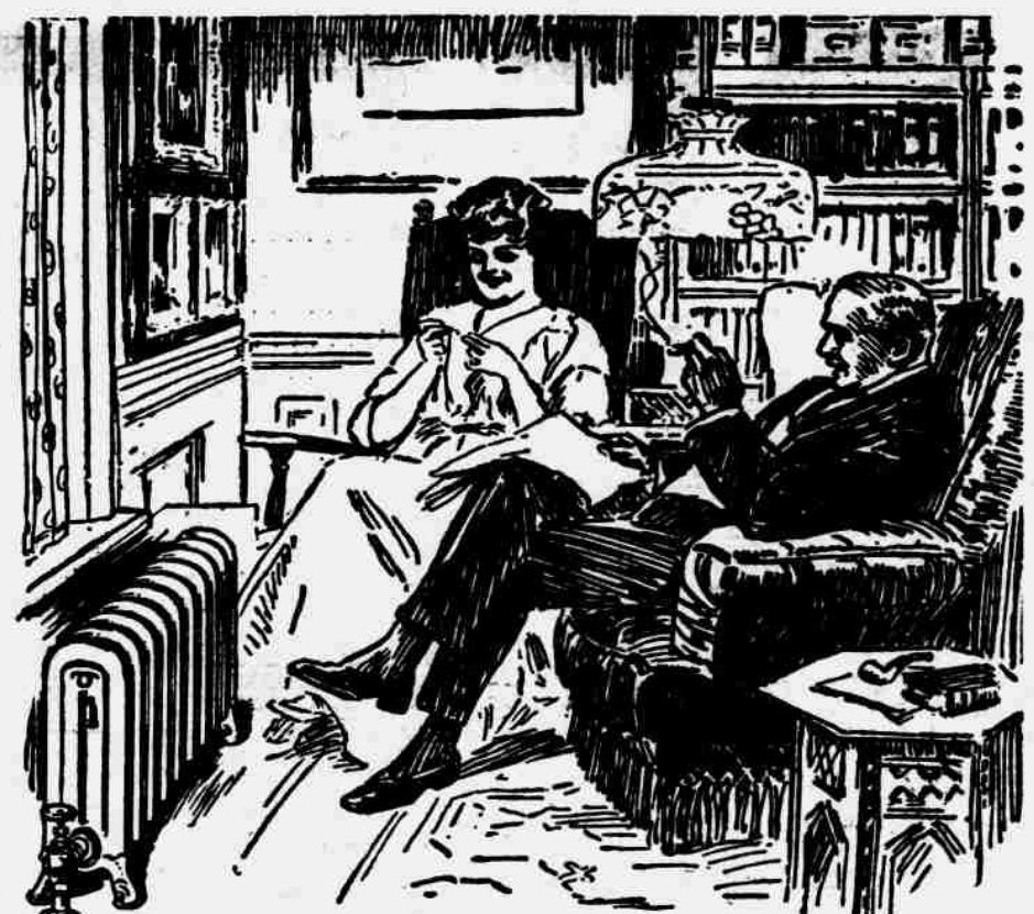
Year 1915: Their life-long ideal heating investment

Twenty-four years ago we began to make and sell these now-world-famous heating outfits. Every outfit that we sold then and since is giving ideal heating results, for even conflagrations and quakes do not destroy them. If buildings are remodeled or wrecked, the outfits are used again, as they are made in units and can be altered to fit. We advertised them as life-long investments, and they are proving so in more than a million buildings at home and abroad.