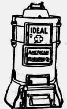
IDEAL Boilers have large fuel pots in which the air and coal gases thoroughly mix as in a modern gas or oil burner, thus extracting every bit of the heat from the fuel. Easier to run than a stove.

Made in sizes to fit old or new stores, offices, flats, schools, churches, garages, as well as houses and cottages in country or city. No rekindling the fire all season. Same water is used for years. Phone your nearest dealer today and get his estimate. Prices now most attractive and at this season you get the services of the most skillful fitters. Ask for pamphlet (free). "Ideal Heating Investments." Puts you under no obligation to buy.