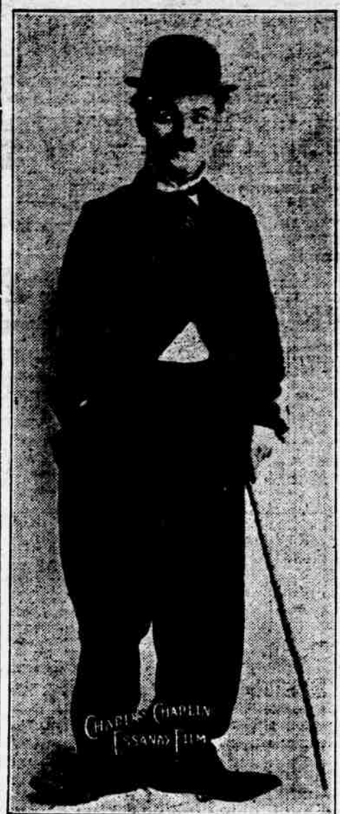
Charles Chaplin in the 2-act Essanay Comedy "Shanghai," at Arcade today and tomorrow.