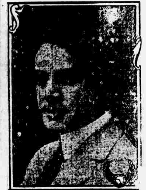
William Russell as "Blair Stanley" in "The Diamond From the Sky."

Badly burned in the duel scene in "The Diamond From the Sky," William Russell, who is portraying the part of "Blair Stanley" in this monster continued photoplay, insisted that he be permitted to continue with the scene. Russell's nerve was all that enabled him to continue, the torture from the burns, which extended from