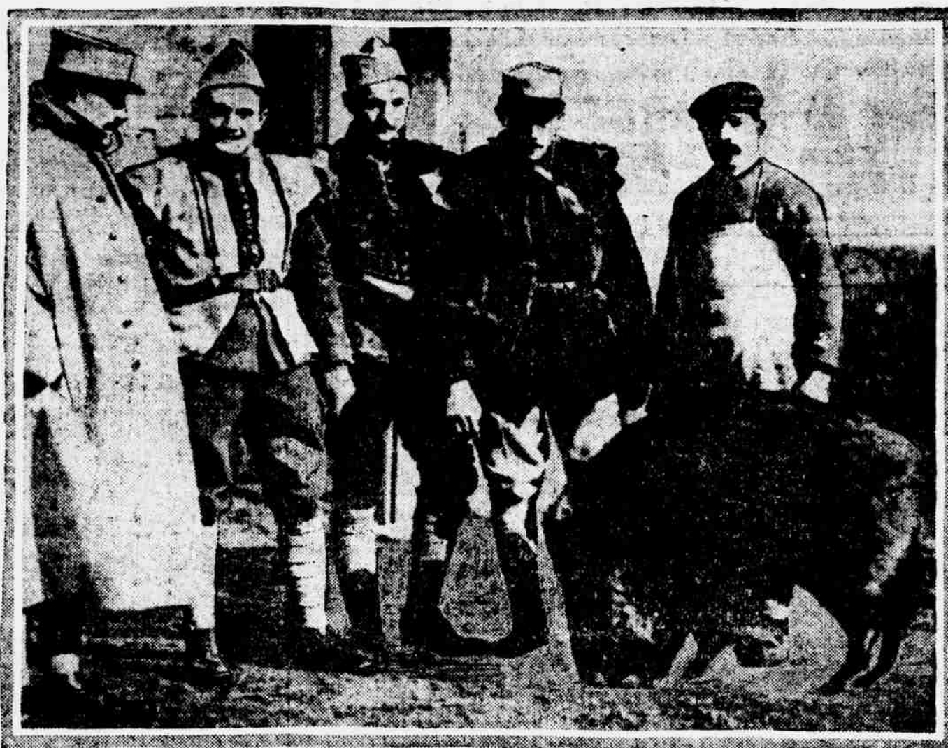
FRENCH REGIMENT AND MASCOT