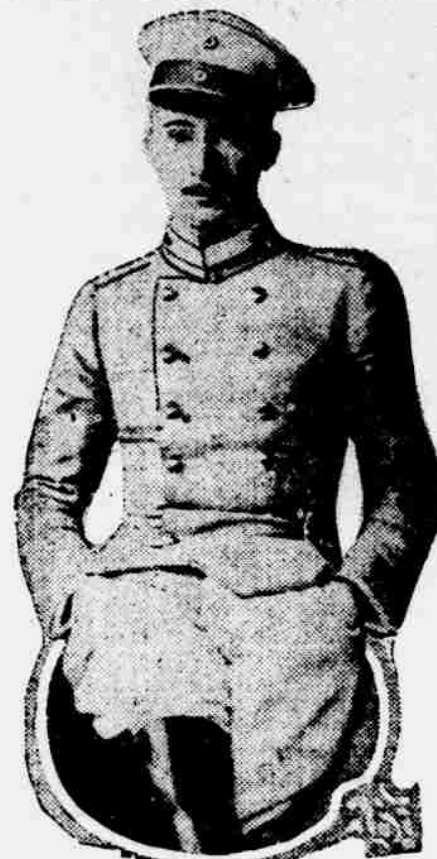
CROWN PRINCE OF GERMANY

What, if anything has happened to the crown prince of Germany? All sorts of rumors are in circulation concerning him, many even coming from Germany. Some say he has been relieved of his command and sent to retirement by the Kaiser, because he presumed to comment adversely on his father's strategy. Others insist he has been dead several months, or that he is seriously wounded. The last official mention of his name was from Berlin, when he was mentioned as being present in a conference of the upper war lords.