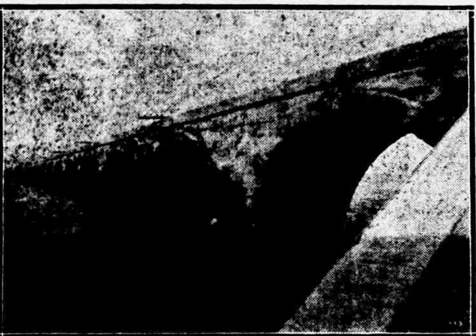
LONG KEY VIADUCT—28-10 MILES LONG