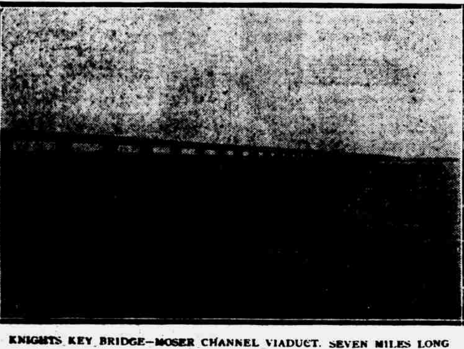
KNIGHTS KEY BRIDGE—MOGER CHANNEL VIADUCT. SEVEN MILES LONG