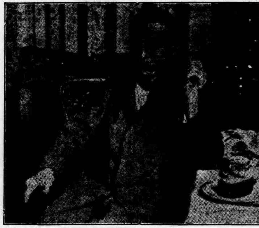
Henry E. Dixey who will appear here this season in his latest success "Mary Jane's Pa."