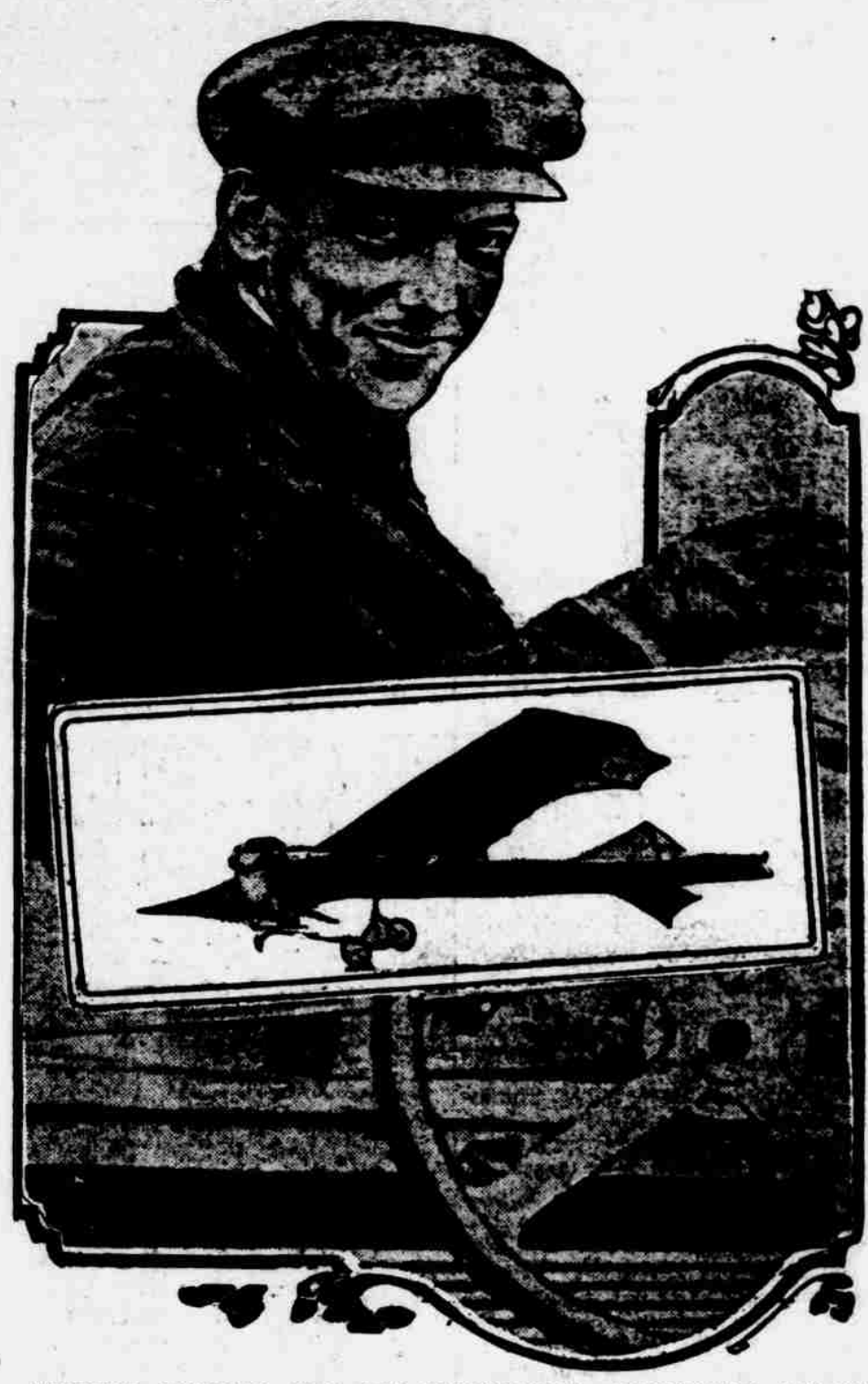
HUBERT LATHAM AND HIS WONDERFUL AEROPLANE "DRAGON FLY." LATHAM HAS JUST ESTABLISHED A NEW WORLD'S RECORD FOR DISTANCE, COVERING IN SUSTAINED FLIGHT 154 KILOMETERS, 650 METERS, OR 95.8 MILES.