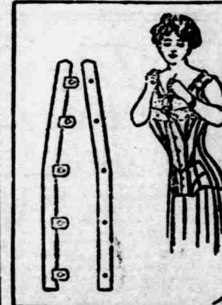
SHOWING THE CURVED STEEL.

An invention of interest to women is the new corset clasp here shown, which is designed to add much to the comfort of the user. These clasps are so shaped that when a corset provided with them is fastened on the wearer they incline slightly outward from about the waist line to the top of the corset, and because of this outward inclination the steel cannot press uncomfortably against the wearer. In some makes of corsets this fault of inward pressure is so pronounced that it causes real suffering, and the after effects are sometimes serious. It fre-