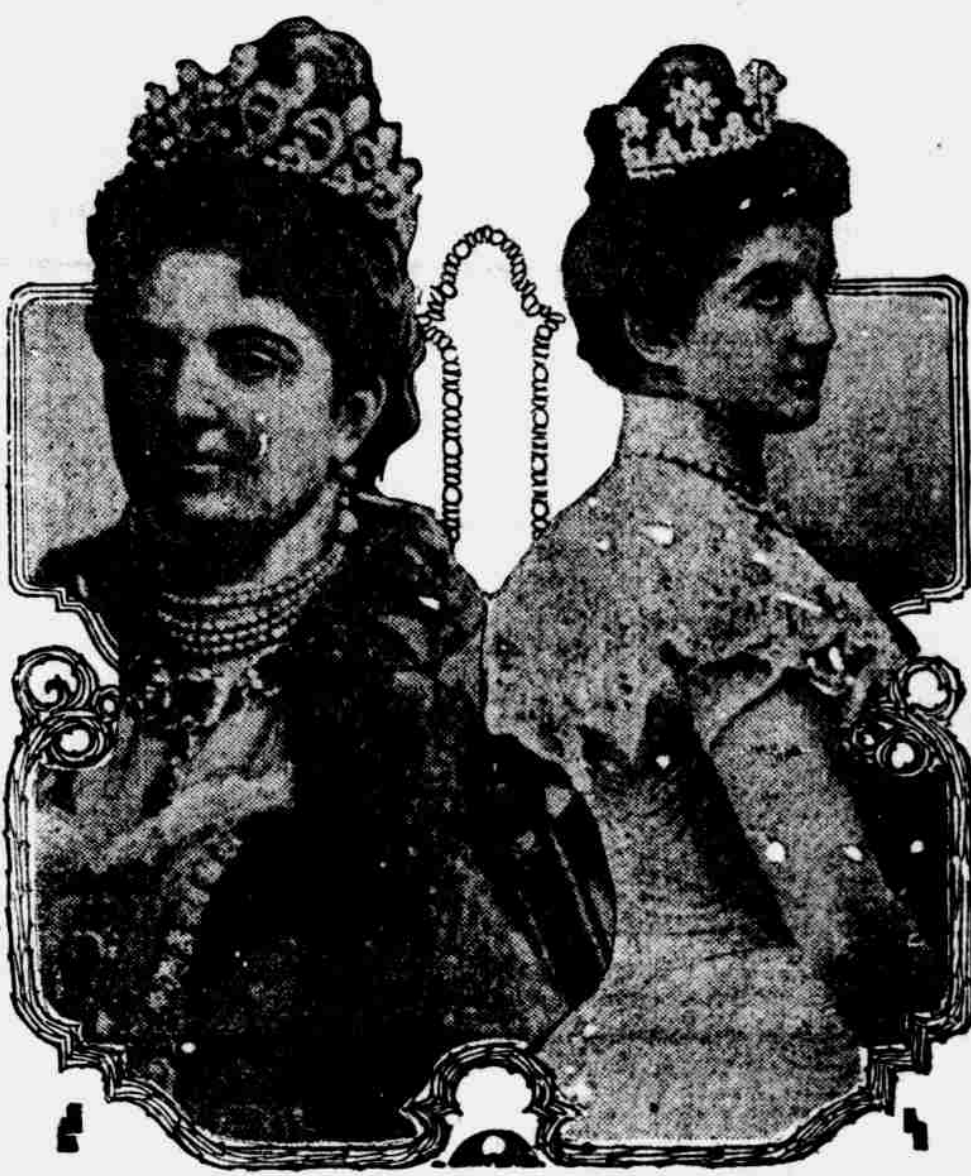
The Dowager Queen Margherita of Italy on the left and Queen Elena on the right, who were separated by the Abruzzi-Elkins affair.