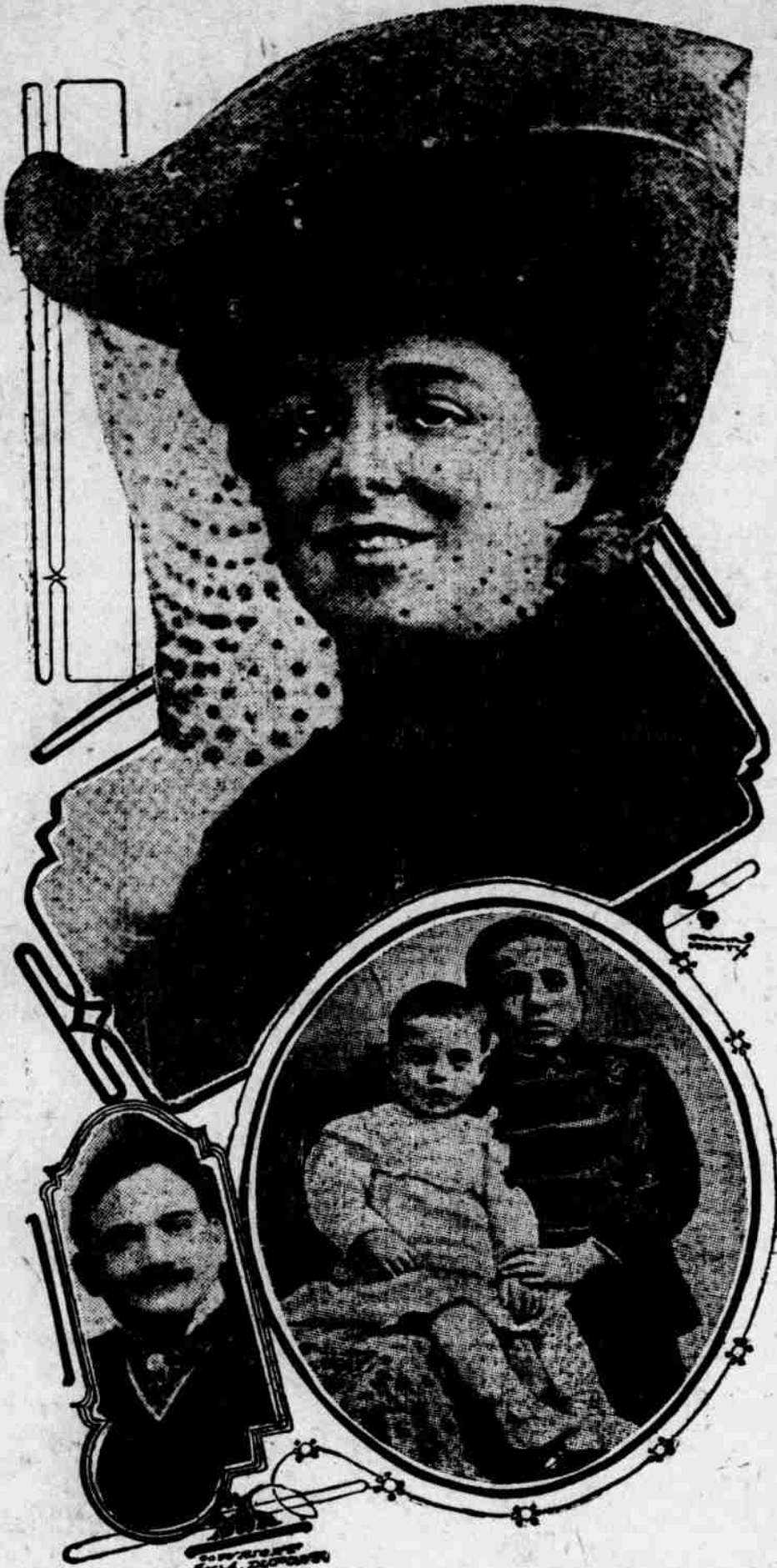
The upper picture shows the woman who deserted Caruso for a chauffeur. Below are shown Caruso, the Caruso children, Enrico and Rodolfo.

Aristotle was the founder of the science of botany. "The Historia Plantarum" of Theophrastus was written about 347 B. C.