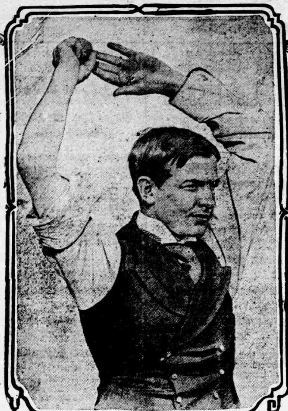
CHRISTY M. ATHEWSON.

The great pitcher of the New York National League Club, from a photo taken just as he was starting his swing for a fast ball.