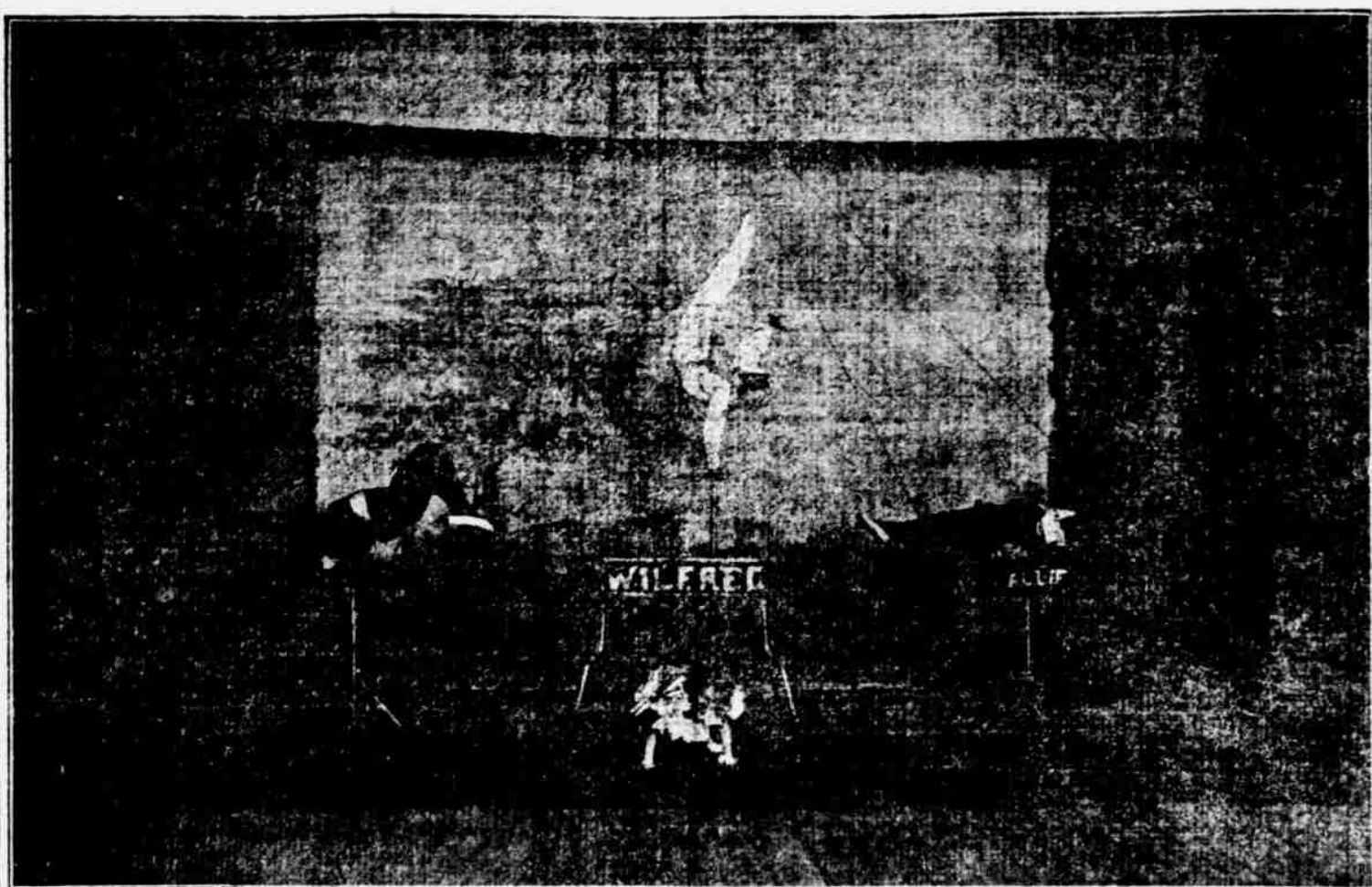
THE ZEMOS—FOUR IN NUMBER—AND THE DOG.