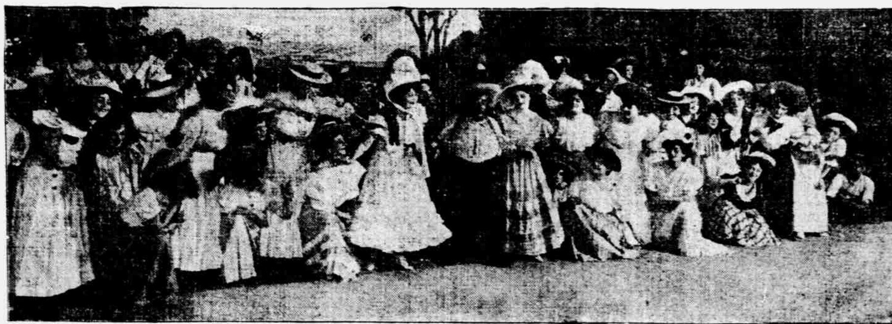
SCENE FROM "DREAM CITY" WHICH WILL BE SEEN FRIDAY NIGHT.