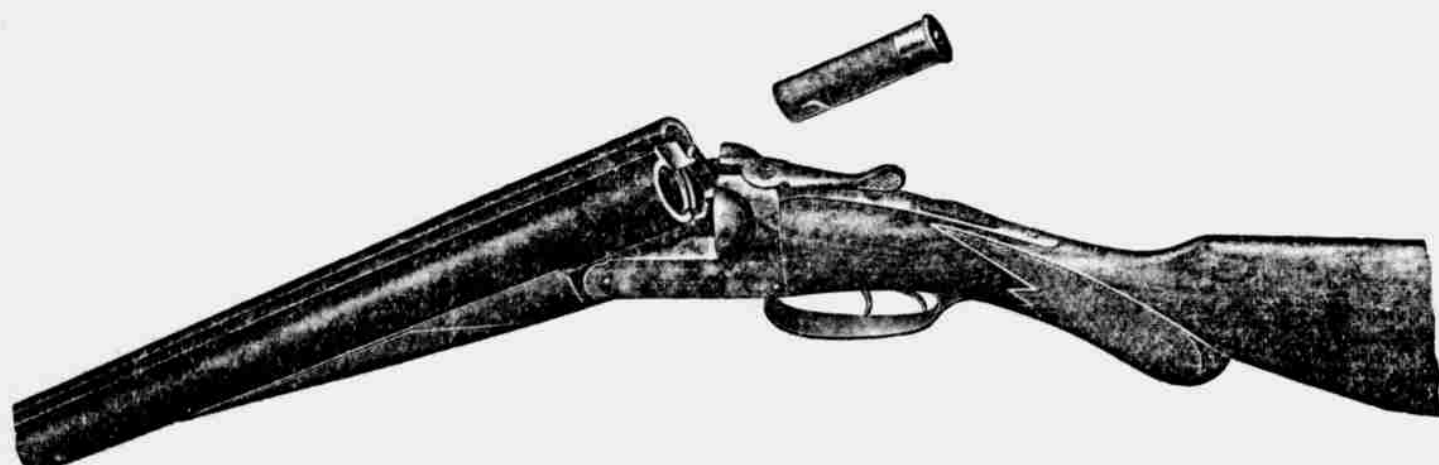
REMINGTON AUTO EJECTOR