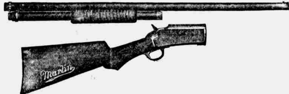
MARLIN TAKE DOWN