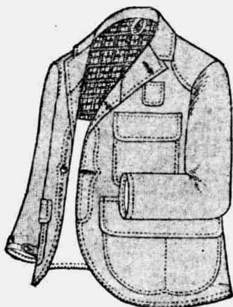
Heavy Twilled, Mackintosh Lined, $3.00