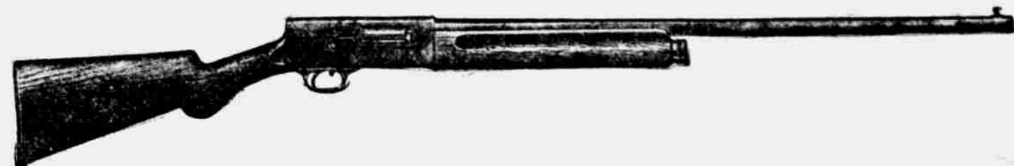
REMINGTON AUTOMATIC GUN