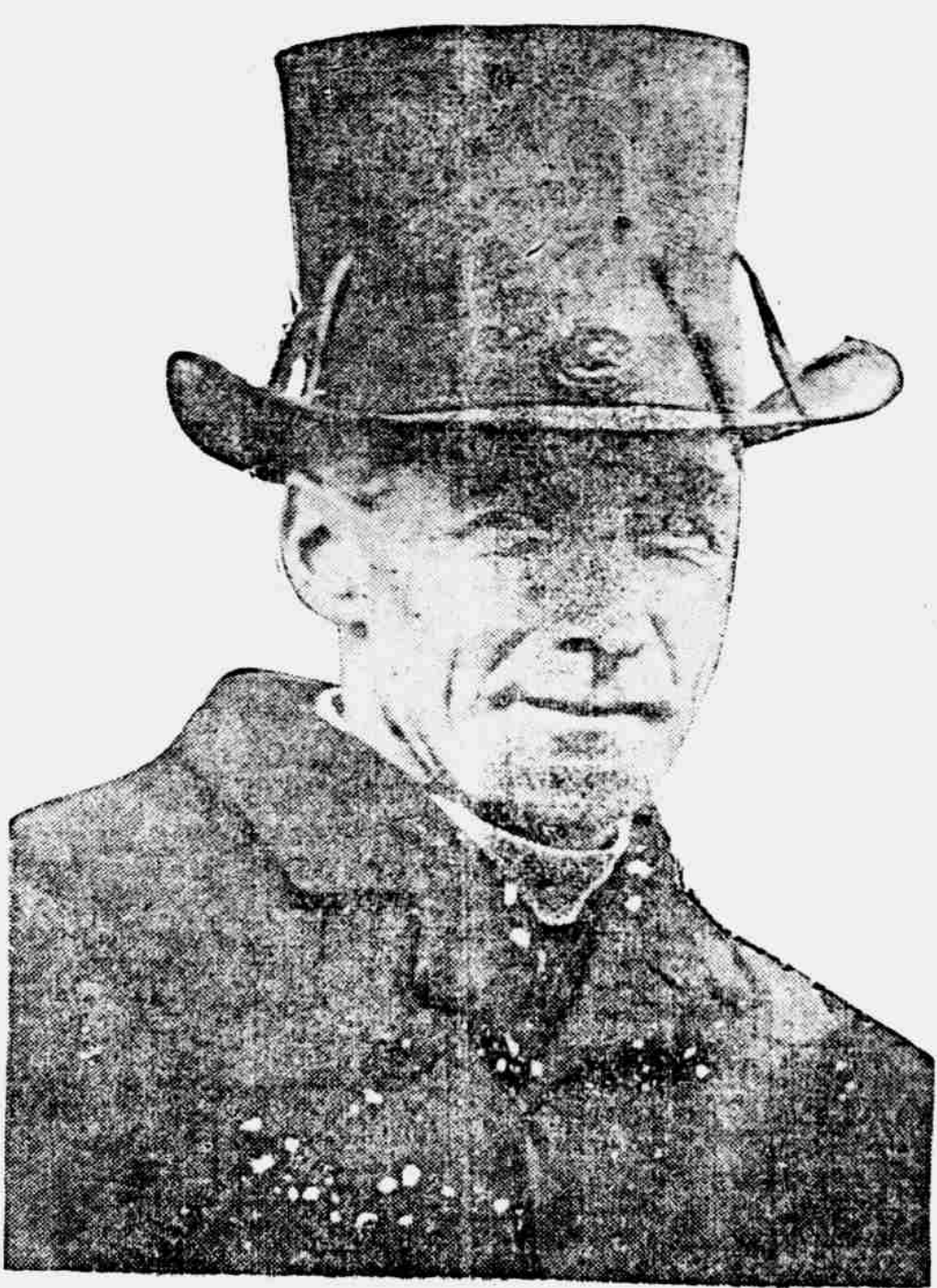
The Right Reverend Arthur Foley Winnington Ingram, Bishop of London, celebrated preacher and expert golf and tennis player, who is now on a visit to this country.