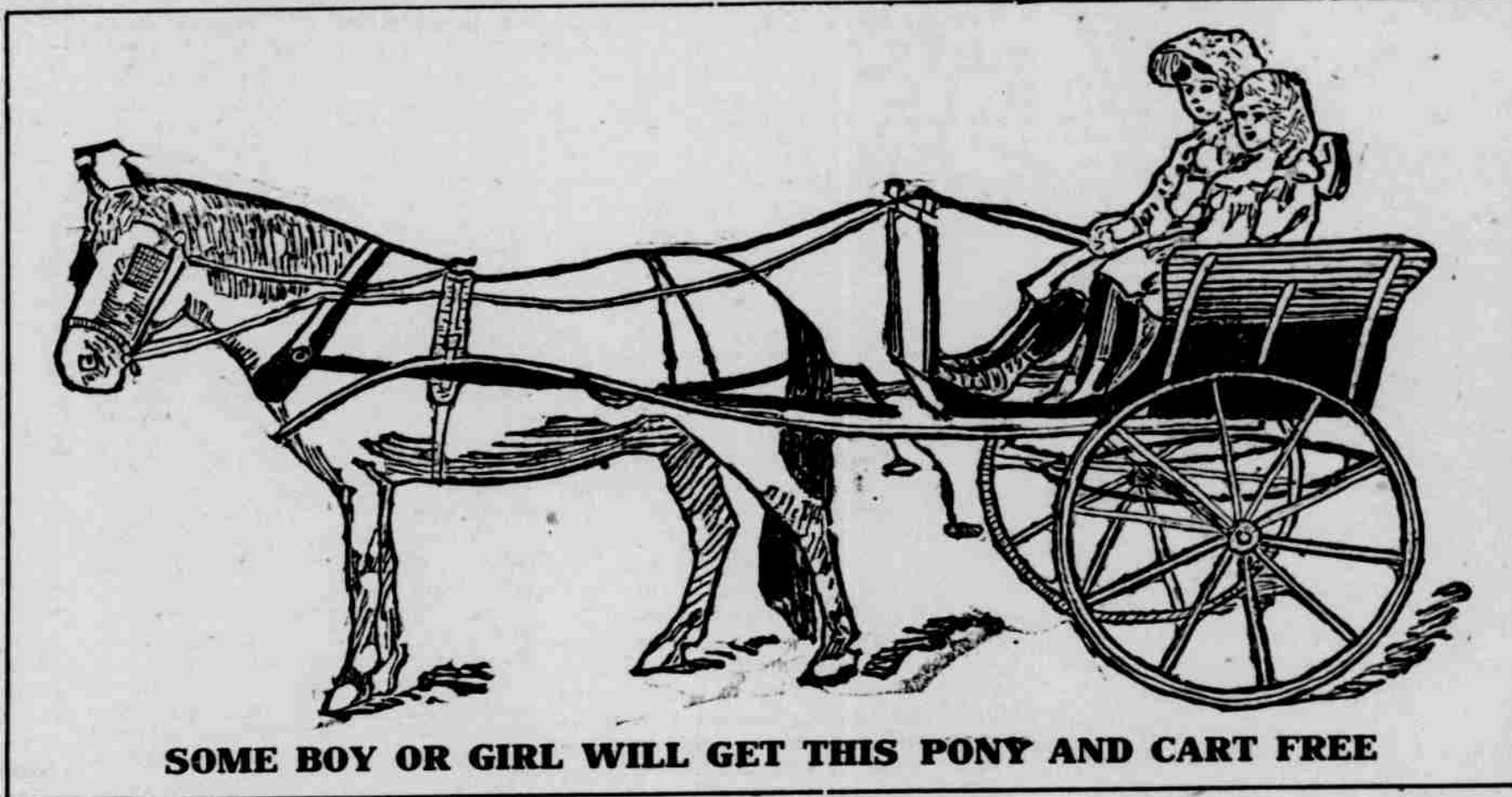
SOME BOY OR GIRL WILL GET THIS PONY AND CART FREE

The boy or girl in Richmond, Eaton, New Paris, Liberty, Centerville, Cambridge City, Dublin, Milton, Hagerstown, Fountain City, Geensfork or Lynn, who has a little hustle in them, can get this beautiful outfit, pony, cart and harness, without spending a single cent for it. Think of getting a full-blooded Shetland pony with cart for a few hours' work.