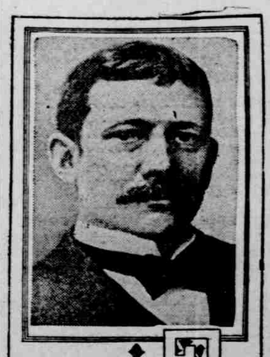
Elihu Root, secretary of state, who is said to have been so overworked that he found it necessary to enter a sanitarium to recuperate.

WILL DIVE FOR $3,000,000 IN GOLD AND JEWELS.