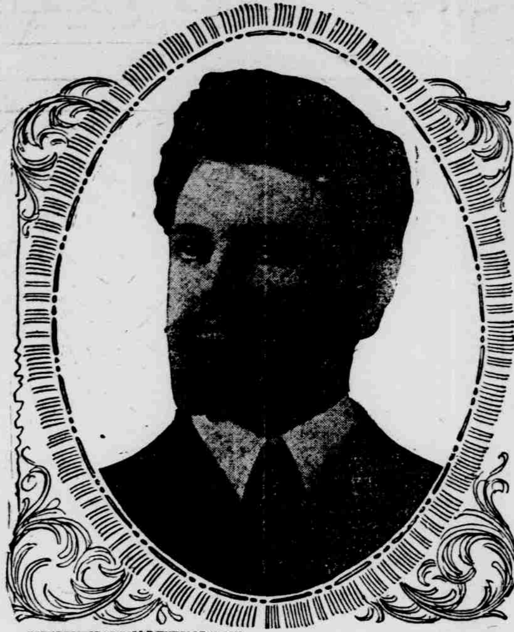
EUGENE F. SCHMITZ, SAN FRANCISCO'S LABOR MAYOR.

Mayor Schmitz has expressed as believing the discrimination between Japanese and American students, in his city is due to the mixed system of education.