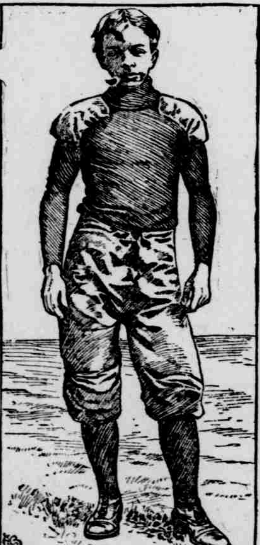
THEODORE ROOSEVELT, JR., IN FOOTBALL COSTUME.

Theodore Roosevelt, Jr., who is just beginning his second year at Harvard and recently returned from a trip in the west, killed three deer while in western Colorado, but no bears. His trip was shortened by an injury to his hand received while hunting. He was reported as in attendance at the fight between Joe Gans and Battling Nelson.