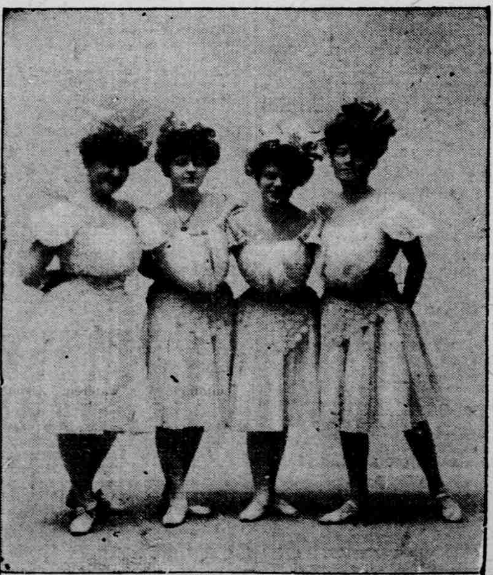
Monday night in "Piff! Paff, Pouff" at The Eastels Girls, who will appear at the Gennett.