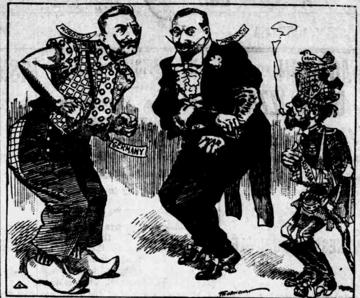
Czar: "Gentlemen, I assure you war is—ehem! I know all about it!"