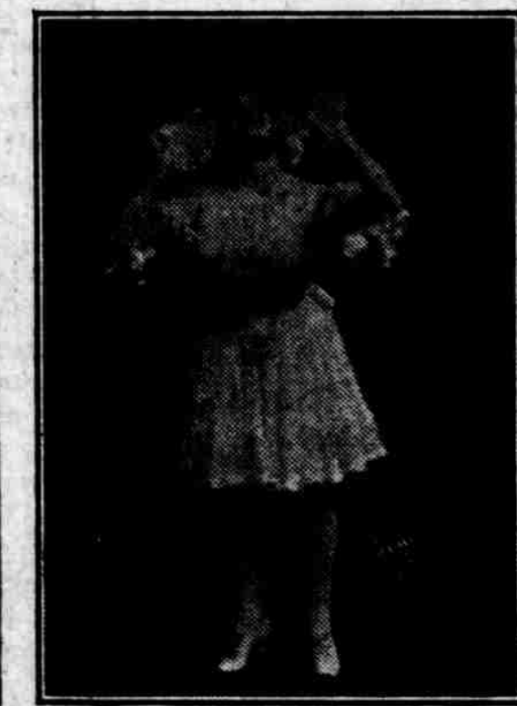
EVA TANGUAY In "The Sambo Girl" at the Gennett Theatre Next Friday Night.