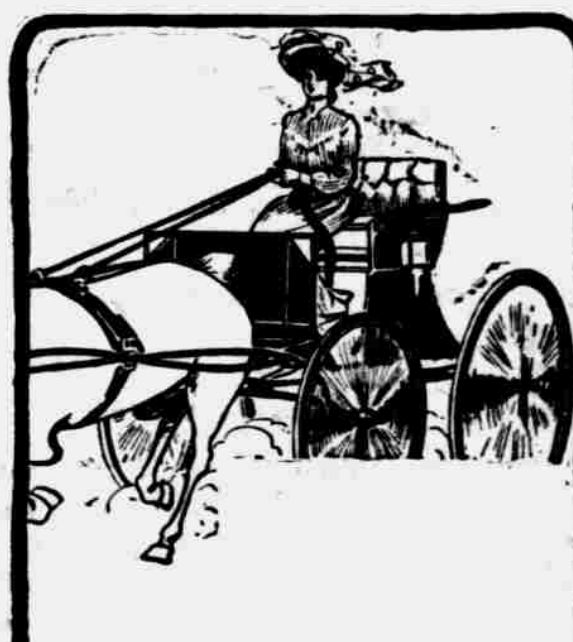
1905 Styles now ready.

Open every evening until 9, Saturdays until 10. Both phones