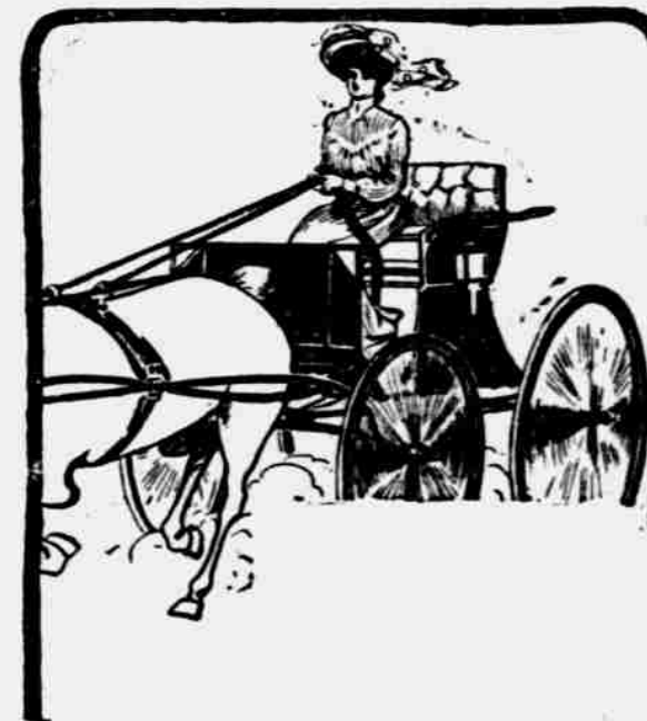
1905 Styles now ready.

Between 4th and 5th. Opp. Model Dept. Store.