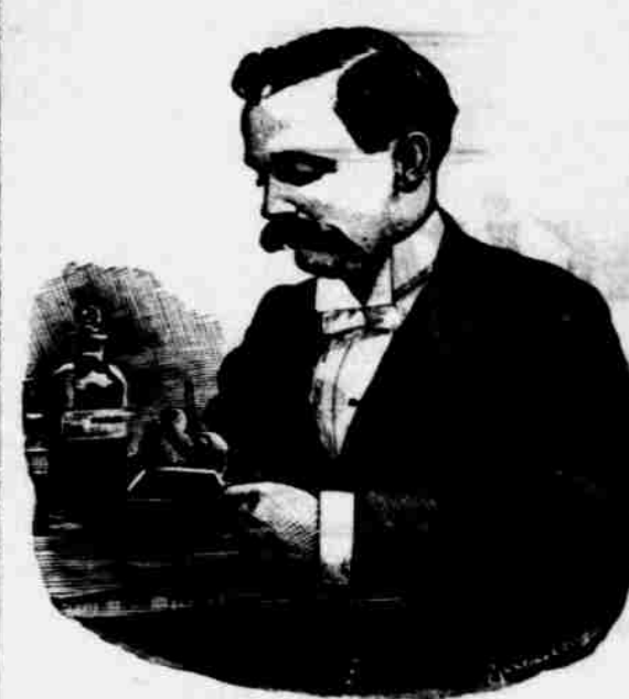
AN HONEST DOCTOR. Thirty Years of Experience.

of the Mayo Medical and Surgical Institute and the ablest specialist in the State, will be at Arnold Hotel