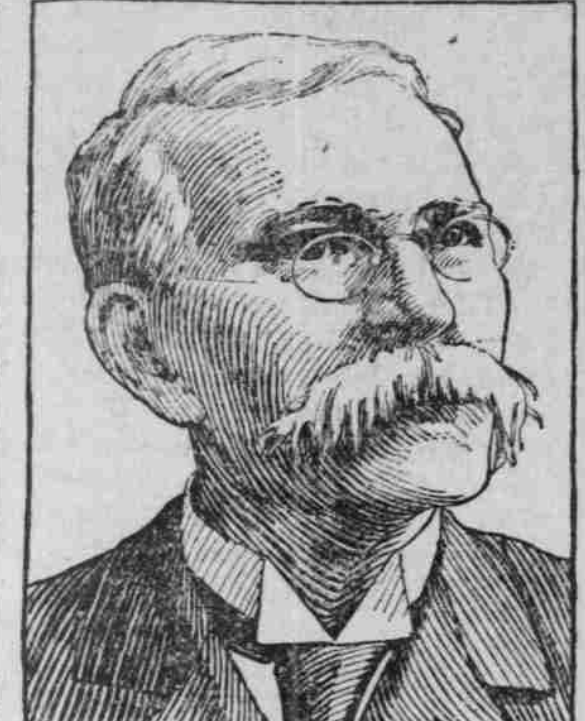
DR. MANUEL AMADOR.