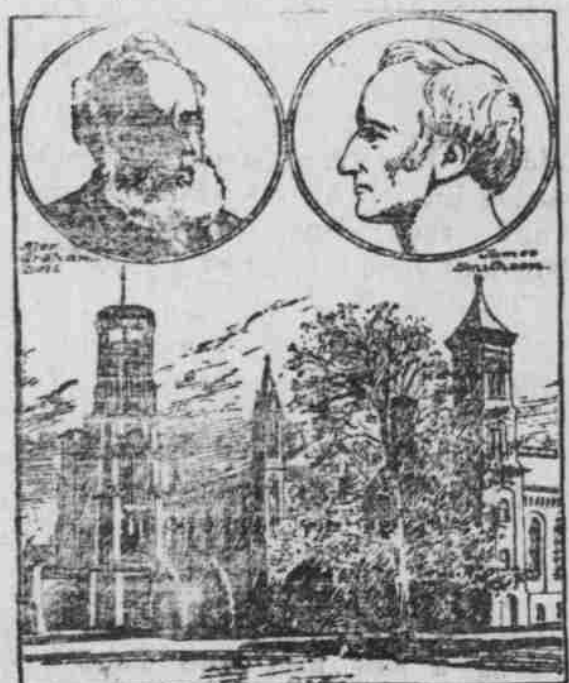
THE SMITHSONIAN INSTITUTION, WASHINGTON.

Washington, Jan. 26.—The casket containing the remains of the late James Smithson, the founder of the Smithsonian institution, who died years ago in Genoa, Italy, which was