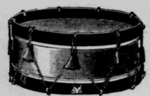
This beautiful Drum, like cut, only 25c