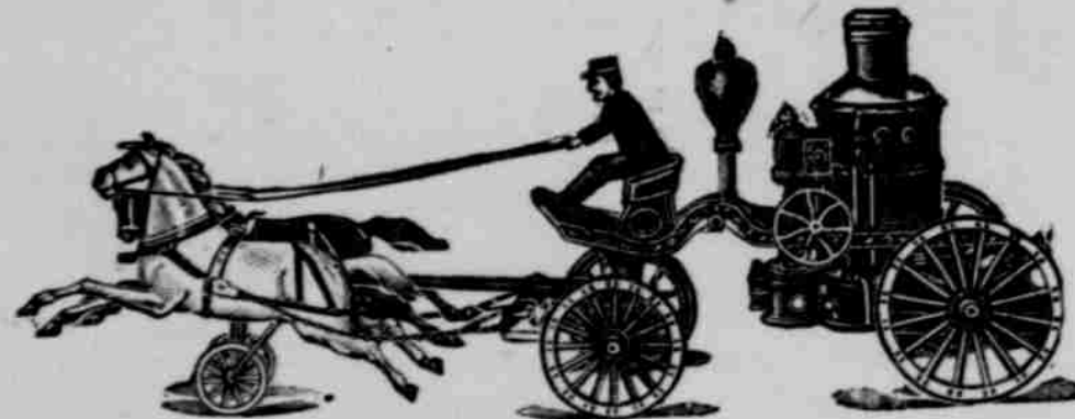
Fire Engine, gong and gallop; like cut, 50c, up to $1.25