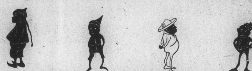
And these chaps are freezing because they can't stay in house with those roaring furnaces.

with one of our $5 hard coal burners that will keep fire all night with a hat full of coal.