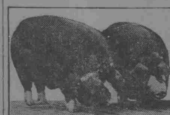
Purebred Poland-China Barrows.

Two Types of Swine. There are two distinct types of swine, namely, the lard and the bacon types. Swine of the lard type far outnumber those of the bacon type in the United States. The lard type is preferred by the people of this country, consequently the majority of feeders produce a rapid-fattening, heavy-fleshed lard type. The bacon type is not raised extensively in the United States. The production of choice bacon is more general in those sections