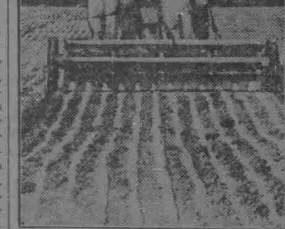
Community Ownership of a Lime Spreader Is Practical and Feasible.

spreaders are often not available because single land owners hesitate to purchase them. Even after the use of lime is established a single machine will often meet the needs of several farmers.