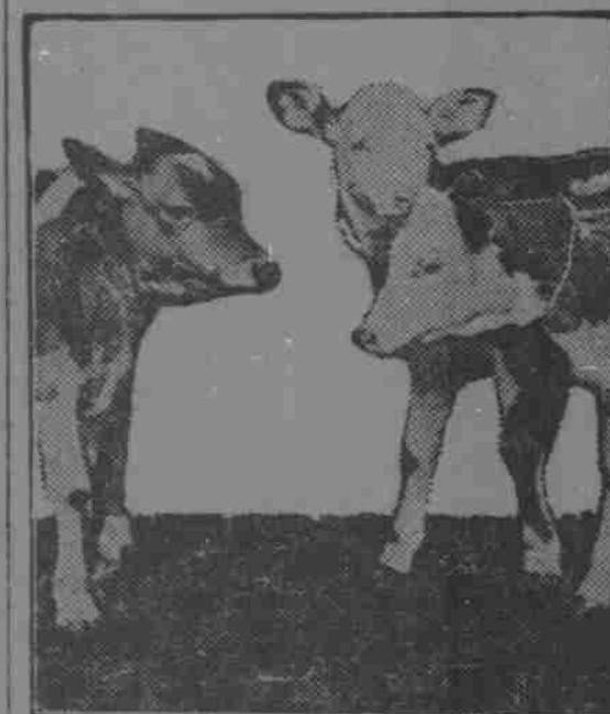
Custom of Preventing Growth of Horns Is Becoming More Popular.

Either caustic soda or caustic potash alone, without the admixture of other substances, answers the purpose satisfactorily. Some years ago, however, certain preparations or "dehorning compounds," composed largely of one or the other of these caustics, were generally used, and as inquiries are still occasionally received concerning such preparations, the following formula is given: Combine in an emulsion 50 per cent of caustic soda,