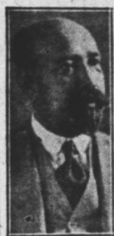
Philippine Resident Commissioner Isuro Gabaldon

Washington. — "Must the heart of America beat only for the freedom of Ireland, of Poland and of the Czechoslovaks, and not for the independence of the Philippine Islands?" This was the question Resident Commissioner Isuro Gabaldon addressed directly to the members of the House of Representatives in a speech which was given very close attention and was frequently applauded.