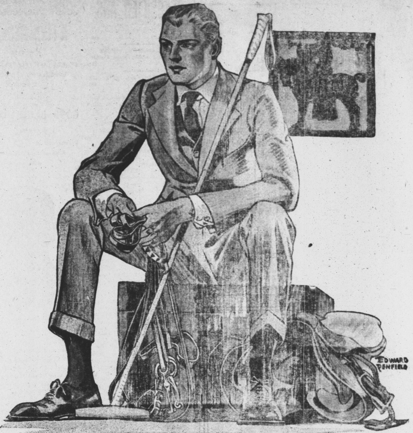
Copyright 1920 Hart Schaffner & Marx