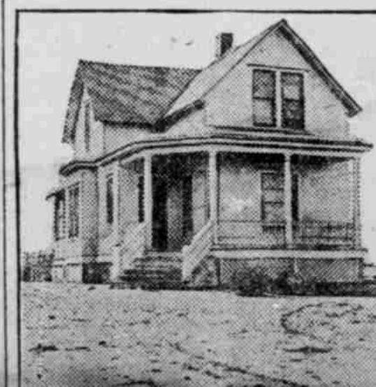
Has Look of Desolation.

Barrenness of land around the home does not call to mind pleasant thoughts, but suggests the glare and heat of summer, the fury of the wind in winter, and a monotony of outlook. What a difference if trees and shrubs, as shown in the second picture, had