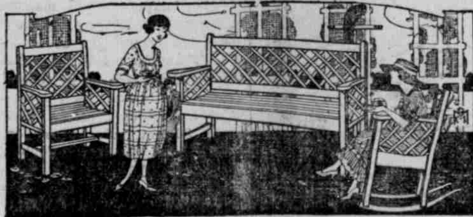
One of the Biggest Bargains We've Ever Offered

We were fortunate in securing another large shipment of Reed and Fibre Furniture and we are offering it at prices far below the present market value. Now is your opportunity of securing one of our popular Reed or Fibre suites for that sun parlor or living room. Matched Suites come in a variety of finishes, and baronial brown.