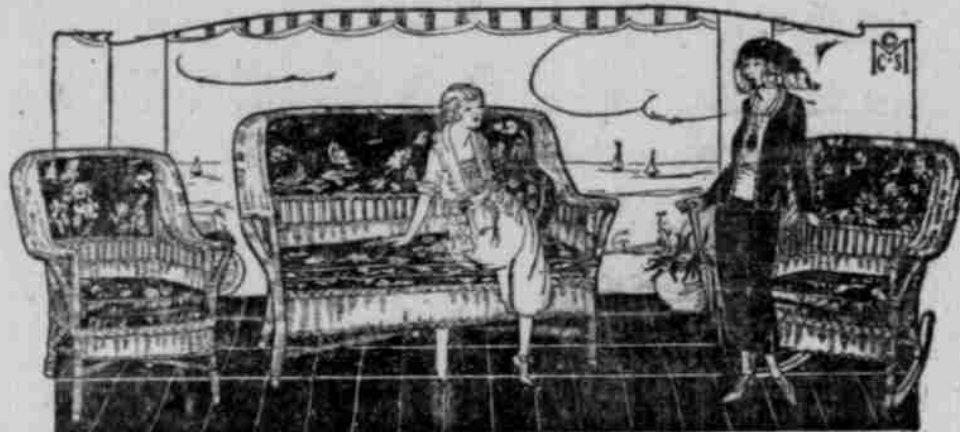
An Unusual Display of Reed and Fibre Furniture

TODAY WE HAVE SPECIALS OF JUST AS WORTHWHILE SAVINGS.