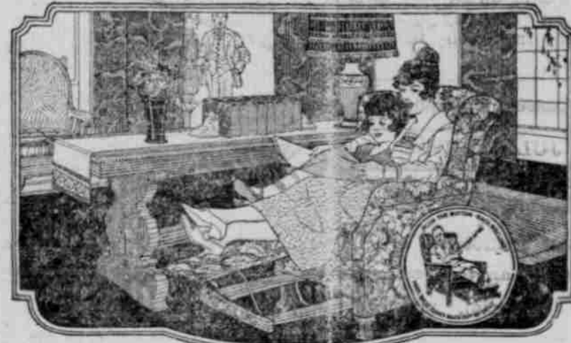
A Big Easy Chair for Mother

We have only a limited quantity left and do not want to carry them over until next season.