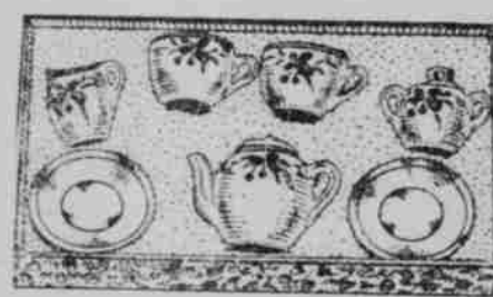
CHINA TEA SETS

Consisting of sauce pan, kettle, frying pan and pudding pan. In neat box, set at $9.50