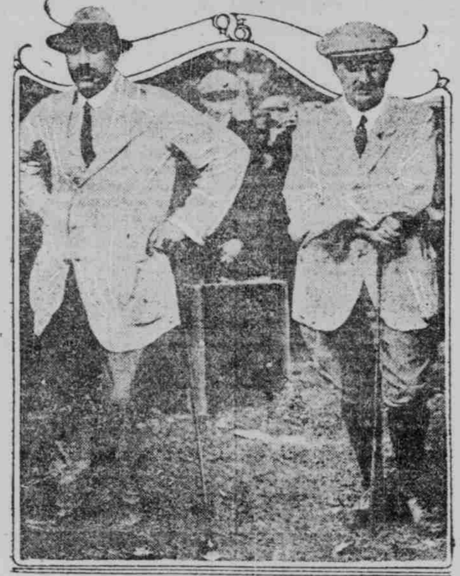
Edward Ray and Harry Vardon. Note Ray's unconventional golf togs.

Harry Vardon and Ed Ray, noted British golf professionals, have come to the U. S. to play in the U. S. open championship tourney at Toledo, and possibly other tourneys. Vardon and Ray came to America in 1914 and their defeat by Francis Ouimet, then a mere boy, in the open championship, was one of golf's biggest sensations.