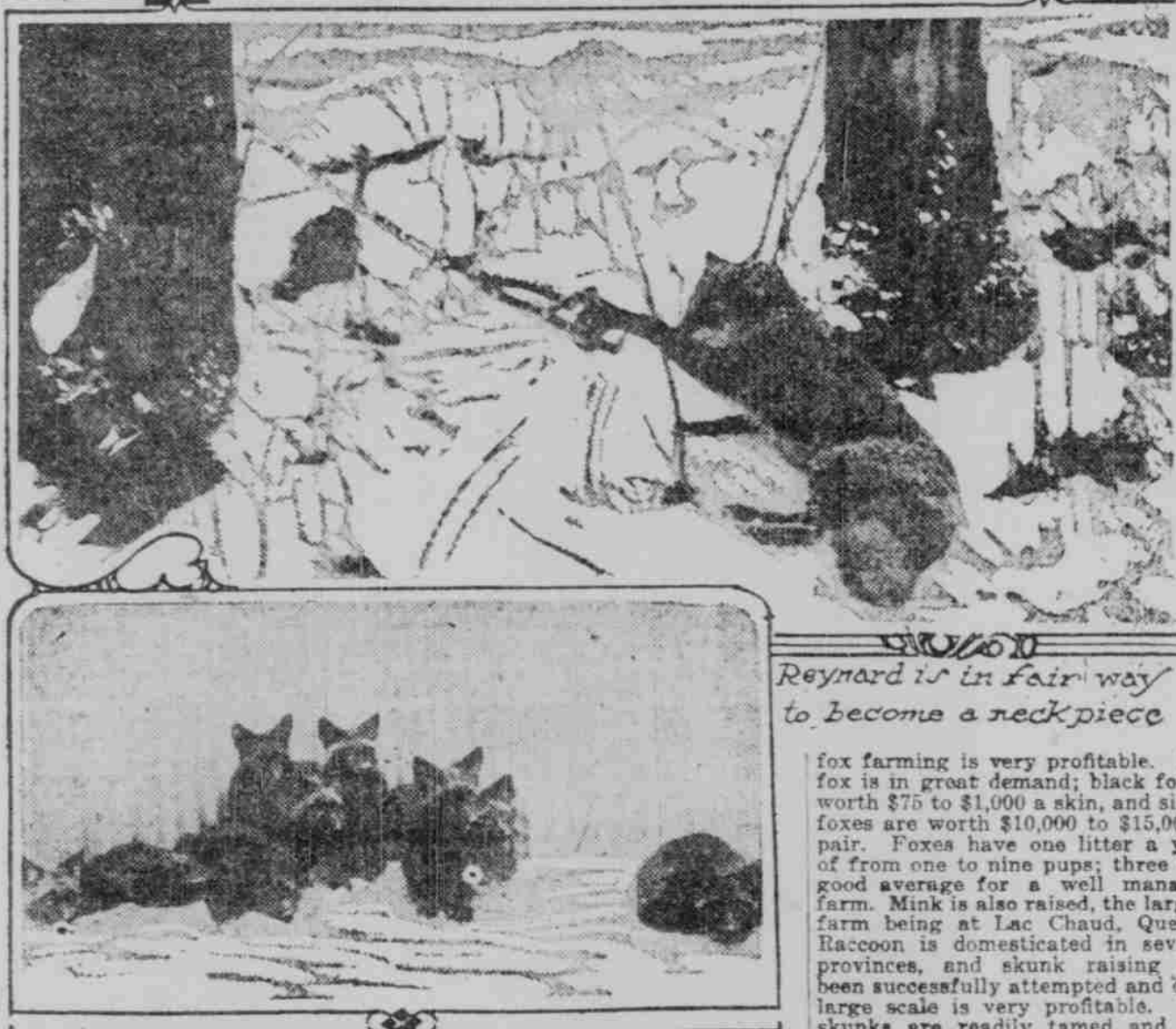
Cubs at Atlin Fox Farm

The growth of population in the United States has killed or driven away most of the animals wont to supply furs for our better halves and for such of our lesser halves as can afford them after the ladies are supplied. The old-time trapper is practically extinct in this country. He has moved his habitat to Canada, where the procuring of fur is still an important industry, but there, too, the fur bearing animals and the men who hunt them are driven ever northward before the advancing outposts of civilization. The demand for fur is greater than ever before—Miladi must have her coats, her muffs, her neckpieces, cost hubby or father what it may. The