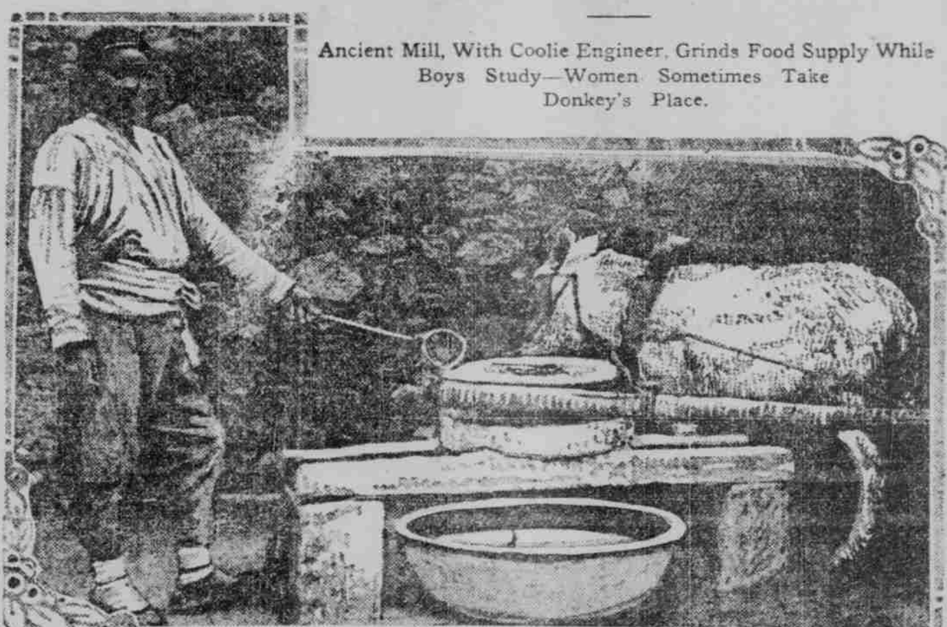
Ancient Mill, With Coolie Engineer, Grinds Food Supply While Boys Study—Women Sometimes Take Donkey's Place.

In the courtyard of a Chinese school this intelligent looking coolie with the Pollyanna expression is the assistant to the donkey which is grinding rice to make flour for the school children.