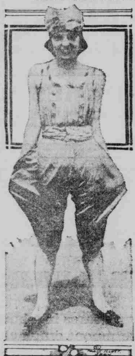
Dainty miss snapped on beach at Atlantic City with bloomer bathing suit.

Atlantic City has set a style in bathing suits that is expected to spread rapidly. It's none other than the bloomer bathing suit. The bloomers are roomy and have big pockets—which make an extra hit with the fair bathers.