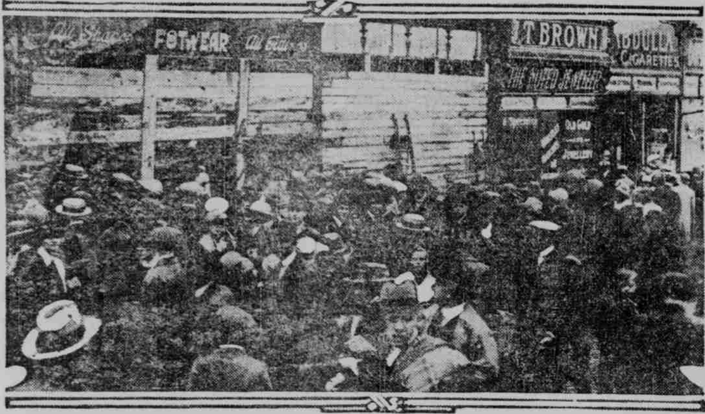
Scene of riot at Liverpool, England.

The greatest labor disturbance in England within the memory of the oldest inhabitant took place recently at Liverpool, when the