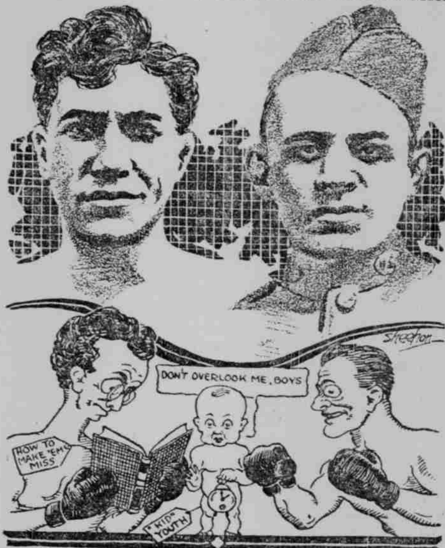
Jack Britton (left) and Mike O'Dowd.

Jack Britton, cleverest of world's champions, and Mike O'Dowd, rugged slugger with a punch, are to meet in the ring at Newark, N. J., August 22. The impending bout has reopened the fight fans' favorite discussion as to the respective merits of scientific boxing as opposed to awkward but powerful slugging.