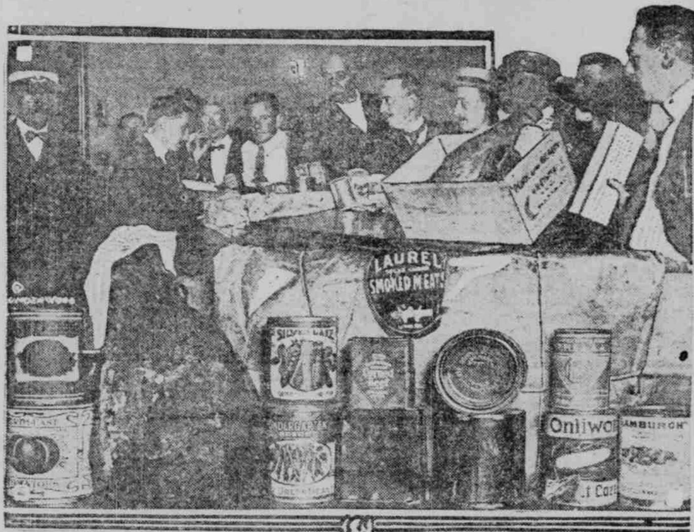
Army food being sold to U. S. customs house employees in New York and photo of samples of food being sold all over the country.

Worst Transportation Walk Out in the City's History Paralyzes Metropolis.