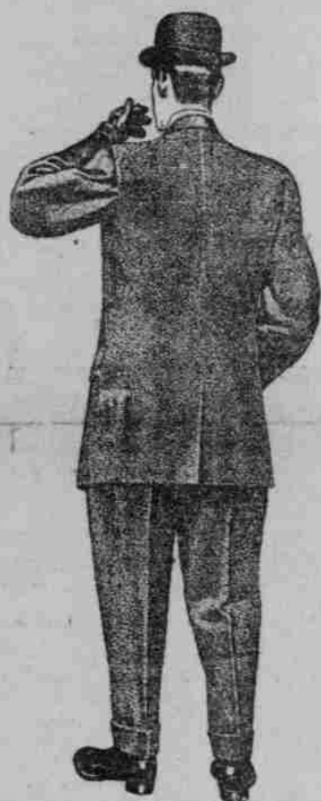
Copyright 1908 The House of Kuppenheimer Chicago

Men's Finest Winter Suits, the very newest plaids and stripes, beautiful gray and brown colorings. All regular lines and sizes, they are not odds and ends, but full lines of each pattern. Sizes 34 to 42 and in some instances 44. All best serge lined, hand finished garments. These suits were bought to sell at $12, $13.50 and $15. There are also some very fine blue and all black kersey overcoats in the lot. You will get the benefit of this cut in price right now when you need a suit or overcoat. You won't have to wait until January or after season to pick from odd suits. Don't overlook this chance, $15 values, just as advertised.