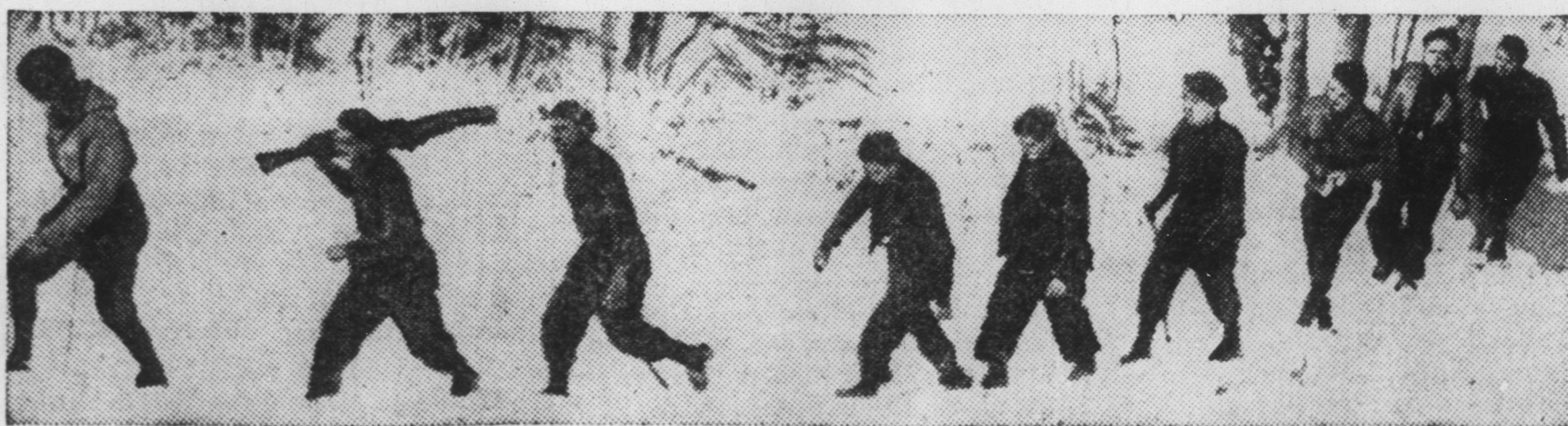
A patrol of young patriots, French guerrillas, sets out through the snow in the Savoy mountain region of France.

SOOTHES DIAPER RASH MEXSANA SOOTHING MEDICATED POWDER