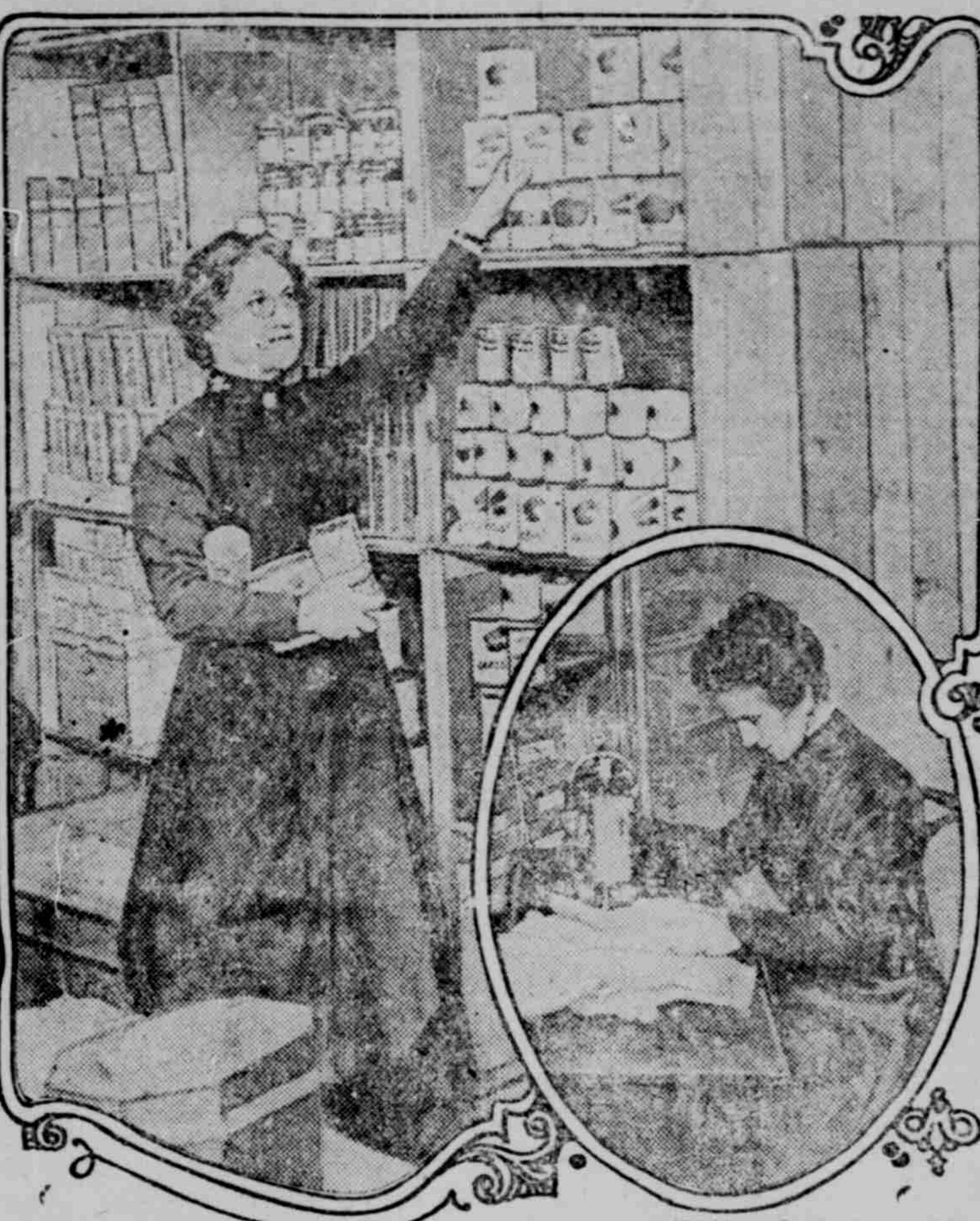
A RELIEF SUPPLY DEPOT MENDING GARMENTS

No; the Salvation Army has not gone into the wholesale grocery business. The picture shows merely one of the Army's relief stations. It is just like scores of others scattered through the cities and towns of the country at strategic points where quick relief can be given in emergency cases. Not limited in their stock to groceries only, these Salvation Army relief depots carry clothing, underwear and other necessities for men, women and children. It is the aim to have at hand for immediate distribution food and clothing for any kind of a case of need. More than 700,000 destitute persons were served temporary relief from these stations last year. And Salvation Army relief depots. It is systematic as well as sensible. The industrial department gears neatly with the relief department. In the industrial homes the broken down