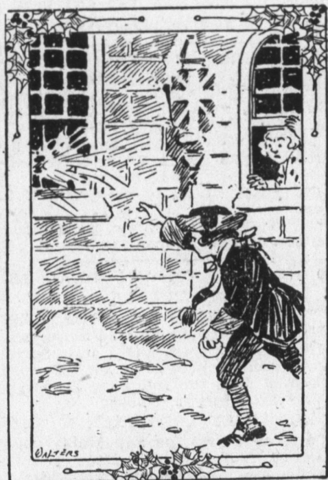
Snowballs Through Royal Windows.

Or perhaps this snowstorm is one of the blizzard kind, with the wind zipping around the house and piling