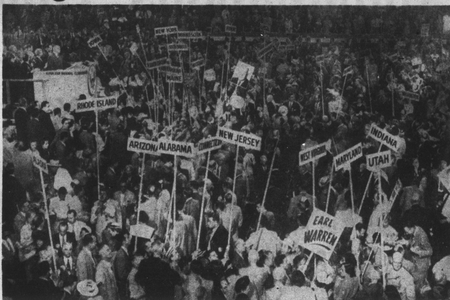
WHILE THE CROWD ROARS —Former President Herbert Hoover waits to speak, tears glistening in his eyes, as delegates and galleries at the Republican national convention in Chicago give him a thundering ovation. The enthusiastic audience interrupted his speech 59 times with cheers, and staged a second demonstration when Mr. Hoover completed his address.