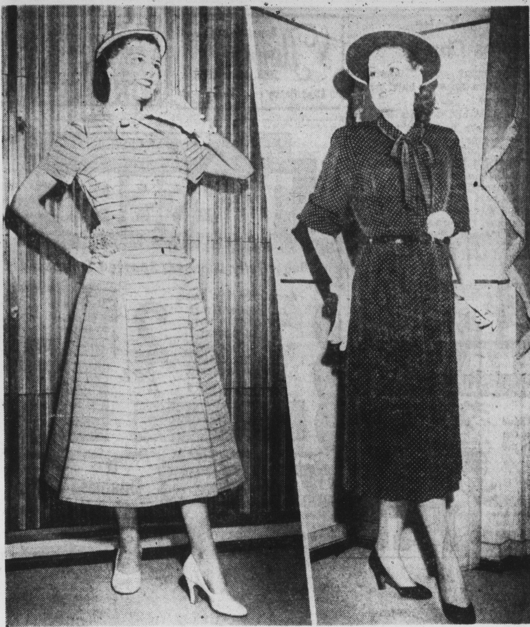
PICK OF THE CROP—Gray cotton dress (left) is tucked horizontally from top to bottom, has parasol skirt, bow neck and tiny shoe buttons up bodice. It sells for $17.95. The handsome navy polka-dot coat dress (sizes 12 to 40) is a flatterer for every figure. It is priced at $14.95. Both are L'Aiglon designs, available at Block's.

nt...17.50 ...19.50 be 25.00 ...25.00 ...27.50