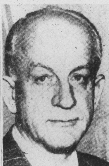
LICENSED—Sumner Welles, 59, former undersecretary of state, and former Austrian heiress Harriette Post von Jeszensky, 57, obtained a marriage license in New York. It's the third matrimonial venture for each.

PANMUNJOM, Korea, Jan. 9.—The Communists yielded to all United Nations demands on supervision of a truce today except the one that would bring final agreement—a ban on military airfield construction. The United Nations Maj. Gen. Howard M. Turner promptly rejected the Red program. Gen. Matthew B. Ridgway's supreme headquarters in Tokyo backed up the Allied truce delegation with a "voice of the United Nations" that the Reds must agree to the airfield construction ban if they want an armistice. The armistice subcommittee discussing an exchange of war prisoners also made no progress. Both subcommittees will meet again at Panmunjom at 11 a. m. Thursday (8 p. m. today Indianapolis Time).